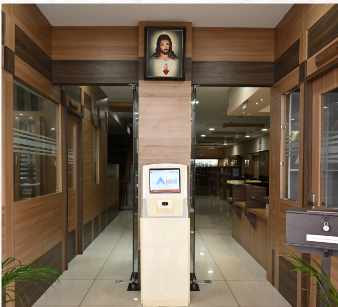
The Central Library of Assumption College (Autonomous), Changanancherry.